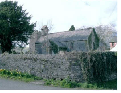
Gwynfe parish Church