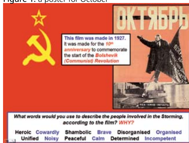
Figure 1: a poster for October

Our fifty minutes were up, and they had not written a word. The class had to decide whose version was closest to the truth. They were split. Half thought the film must be more accurate, because? It's a film . Others were backing the historian (pew,