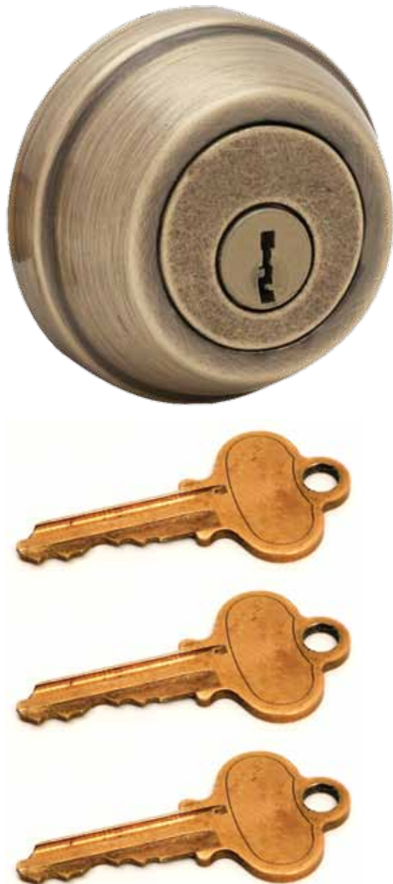
Figure 3: 'Keys' for explaining Nazi antisemitism

as those that occurred in Seville in 1391, 16 Uman in 1768 17 or the Christmas Pogrom in Warsaw 1881. 18 My choice of medieval England and Nazi Germany arises from the fact that it is easier to tease out certain differences between these two periods. While in Nazi Germany a racist ideology was the driving force, there was a strongly religious dimension to medieval antisemitism. There are elements of continuity, but my intent is to show that antisemitisms are not identical; they change over time.