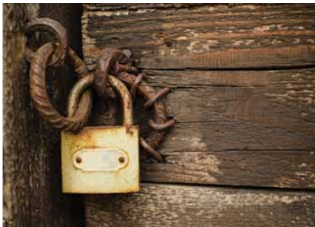
Figure 2: 'Keys' for explaining medieval antisemitism

This is where the pupils refocus their thoughts in order to create historically-specific conceptions of the factors that lead to antisemitism. In this section, the focus remains on causation but also prepares the way for an analysis of change.