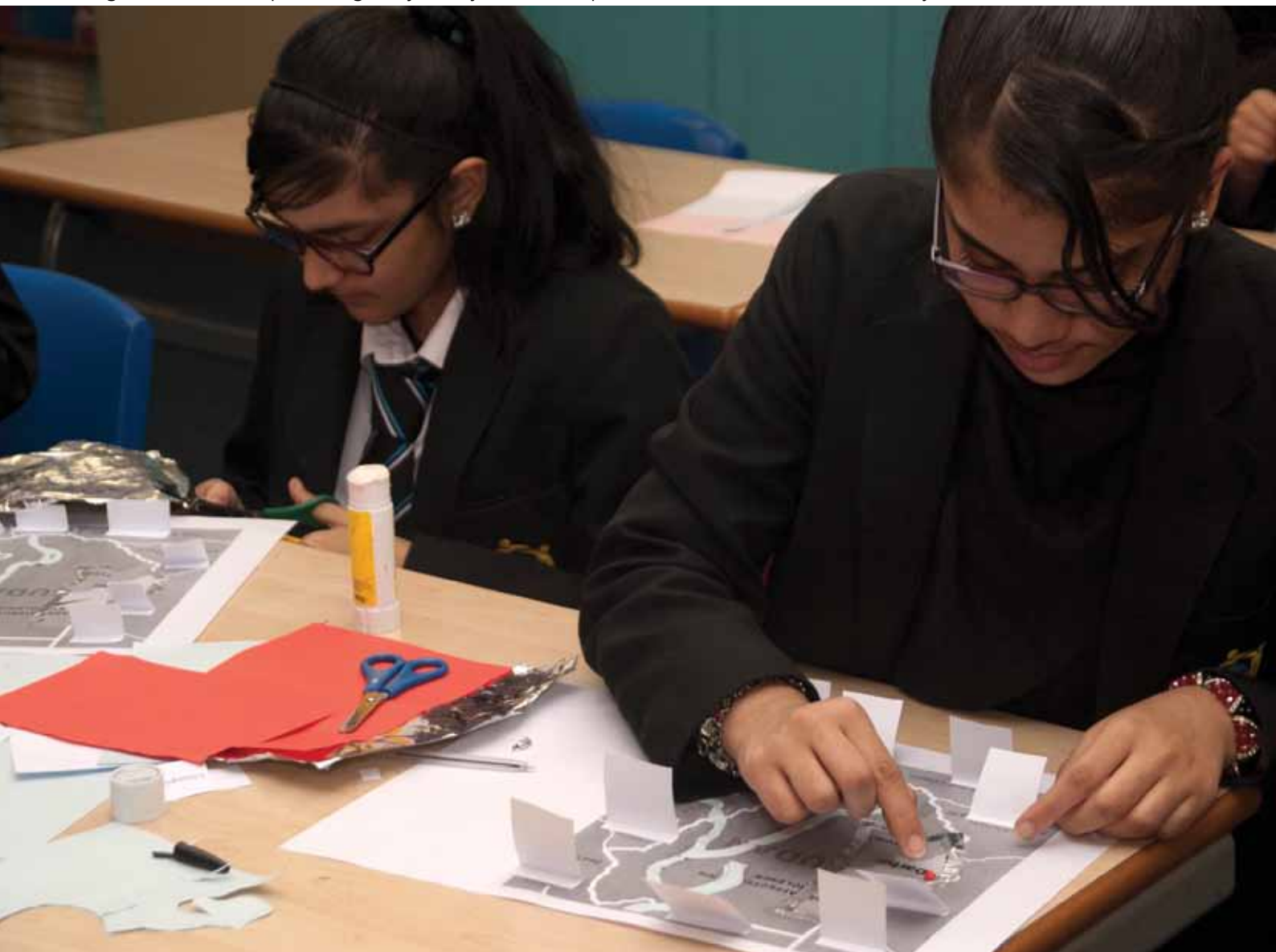
Figure 3: Students plot refugees' journeys on 3D maps of Sudan (Global Awareness Day)

Holocaust. We believe this to be an extremely important part of the history curriculum, and have also raised the profile of the Holocaust during Holocaust Memorial Week for many years, through assemblies and PSHE lessons. Our approach involves examination of the history of antisemitism and of European Jewish communities before the Holocaust. This may help counter any local prejudices, and also helps explain the sense of persecution and fear which is expressed by some local Jewish people today. We also consider it important to examine the role of different forms of Jewish resistance to the Holocaust, as well as positive interactions with non-Jewish communities. This helps to negate the impression of Jewish people as passive victims. Indeed, our students are often quick to empathise with Jewish victims. They often draw comparisons between antisemitism and any prejudice they might have experienced. While there are some parallels with racism today, I am keen for them to recognise the limitations of such parallels and to appreciate the specific nature of European antisemitism, with its deep-seated historical roots, boosted by socio-economic conditions at the time.