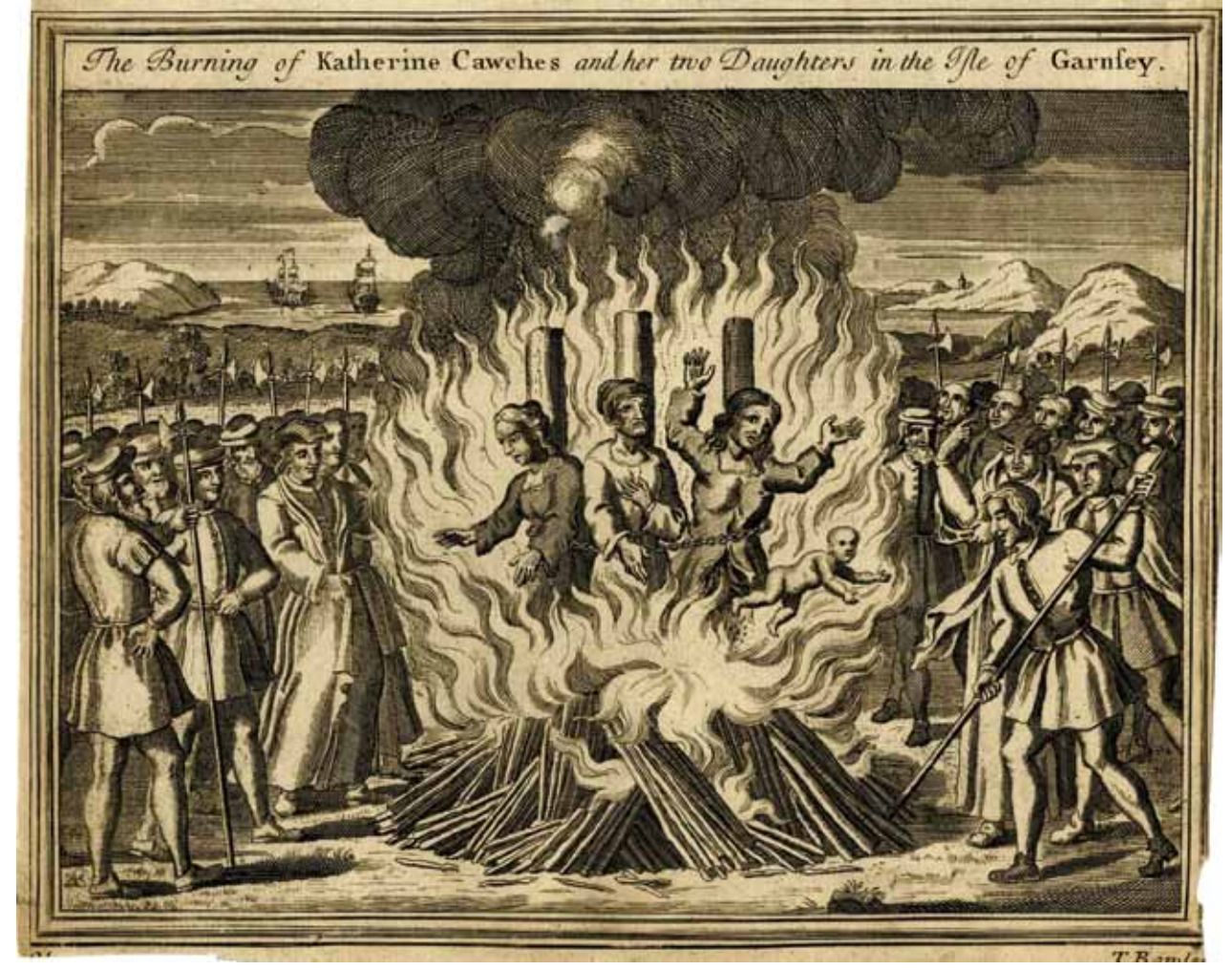
Figure 6: An extract from the frontispiece of The Protestant Almanack for the Year 1700

Figure 5: Illustration of 'The Burning of Katherine Cawches and her two daughters in the Isle of Garnsey, printed in the 1671 edition of Foxe's Book of Martyrs