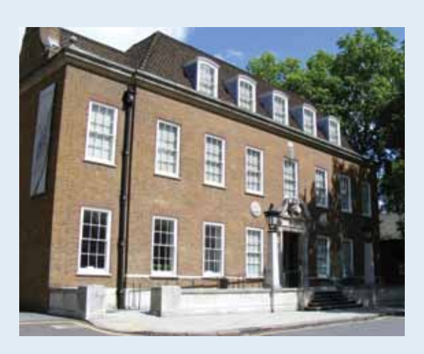
The Foundling Hospital moved to a new building in Brunswick Street in 1745.

Eventually the annual meetings of the Foundling artists – held every 5 November in honour of the Revolution of 1688, of liberty and of Protestantism – led to the creation of the Royal Academy of Art.