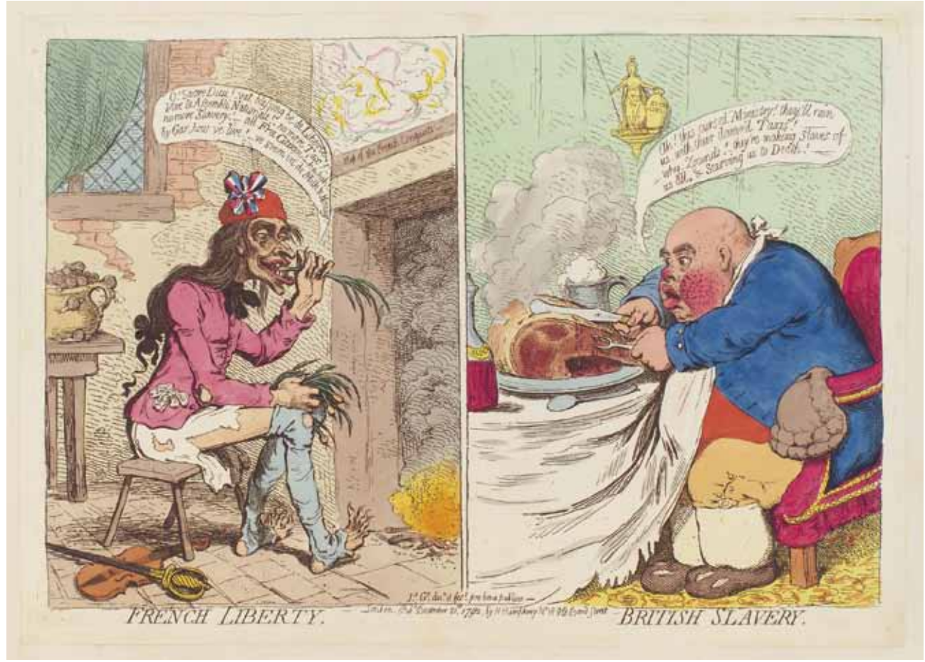
'French liberty British slavery' by James Gillray, hand-coloured etching, published by Hannah Humphrey 21 December 1792