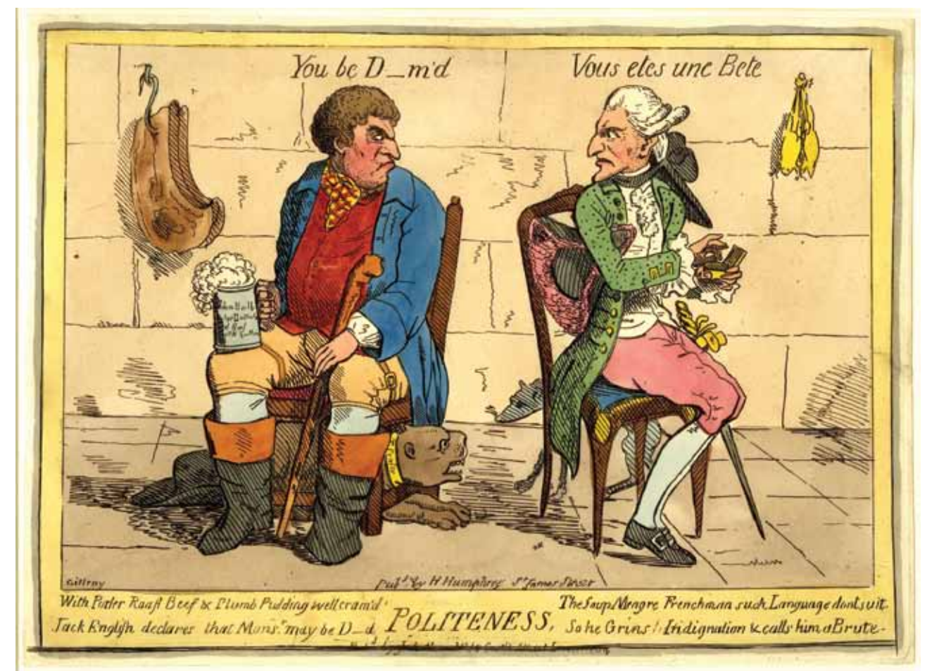
'Politeness' by James Gillray, hand-coloured etching published by Hannah Humphrey 1779