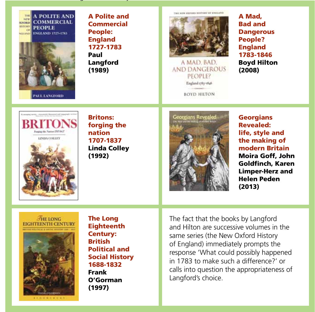
Figure 3: A selection of titles that could be used to develop initial hypotheses about what historians think matters most about the eighteenth century