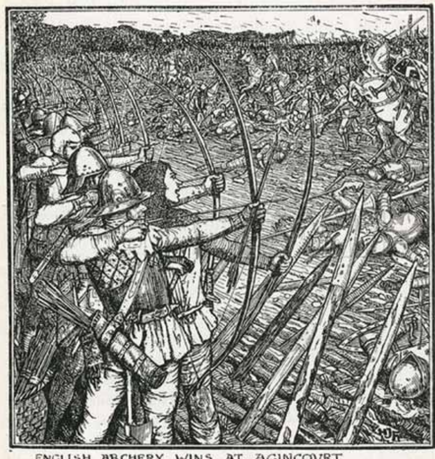
ENGLISH ARCHERY WINS

The principal reason for this lack of mention of Agincourt was probably