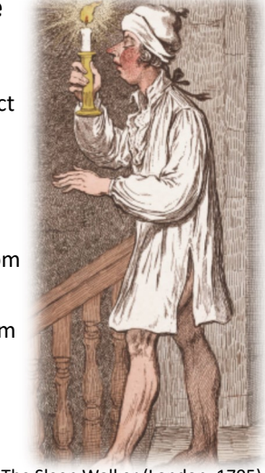
The Sleep Walker (London, 1795),