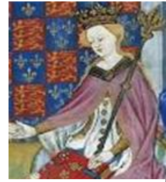
Margaret of Anjou