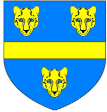
William de la Pole Duke of Suffolk