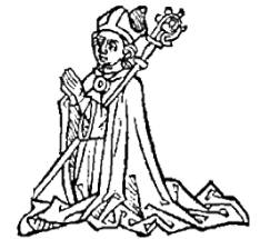
John Stafford Archbishop of Canterbury