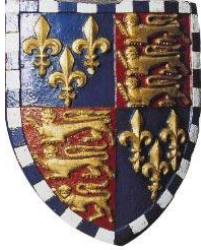
Edmund Beaufort Duke of Somerset