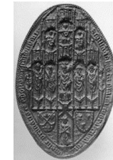
Cardinal John Kemp Archbishop of York