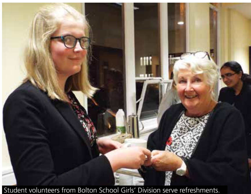
Student volunteers from Bolton School Girls' Division serve refreshments.