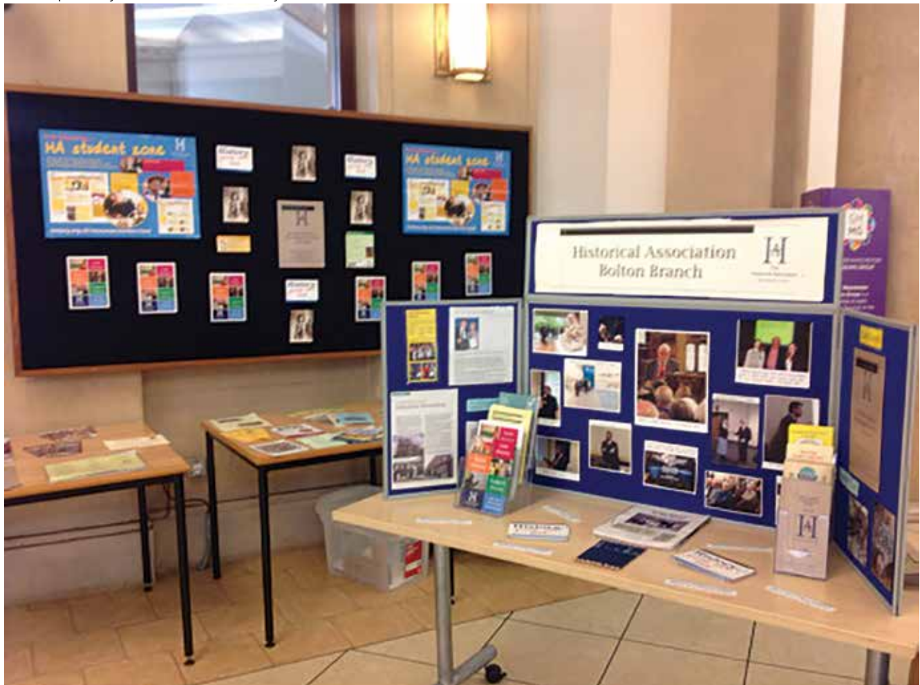
Branch publicity stand at Bolton Library.

to maintain people's interest, but I was finding it too much to include in my role, so it's great to have someone who can spend just a few minutes every evening finding interesting history content to share – it all helps to publicise the branch and the association as a whole.