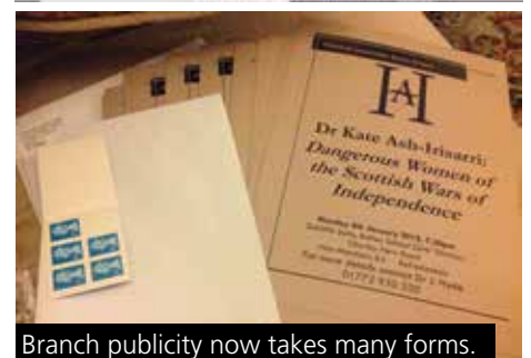
Branch publicity now takes many forms.