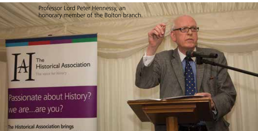
Professor Lord Peter Hennessy, an honorary member of the Bolton branch.

Every month I send out an e-newsletter to our branch members through the branch officers' area of the HA website, and now it's time to co-ordinate some material for the next few months – a book review, a place to go and, of course, details of the next meeting. The book reviews are written by other members of the committee, which is great because it lets members hear someone else's voice for a change! I also send a monthly publicity email to local media and other societies with similar interests. They