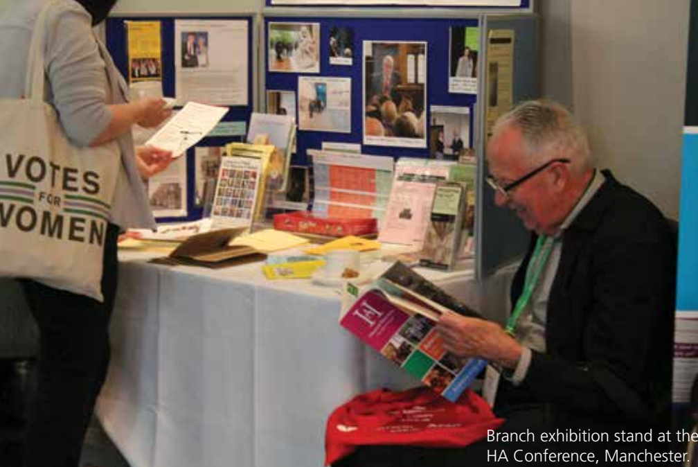
Branch exhibition stand at the HA Conference, Manchester.