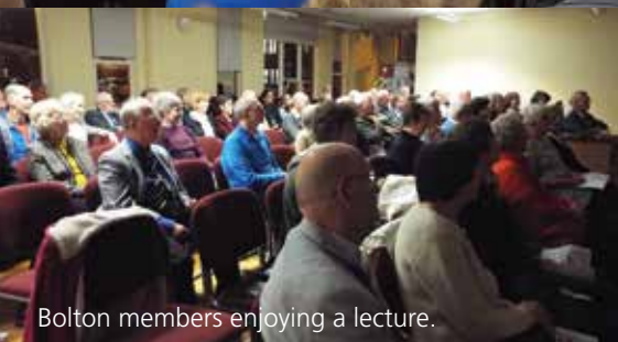
Bolton members enjoying a lecture.