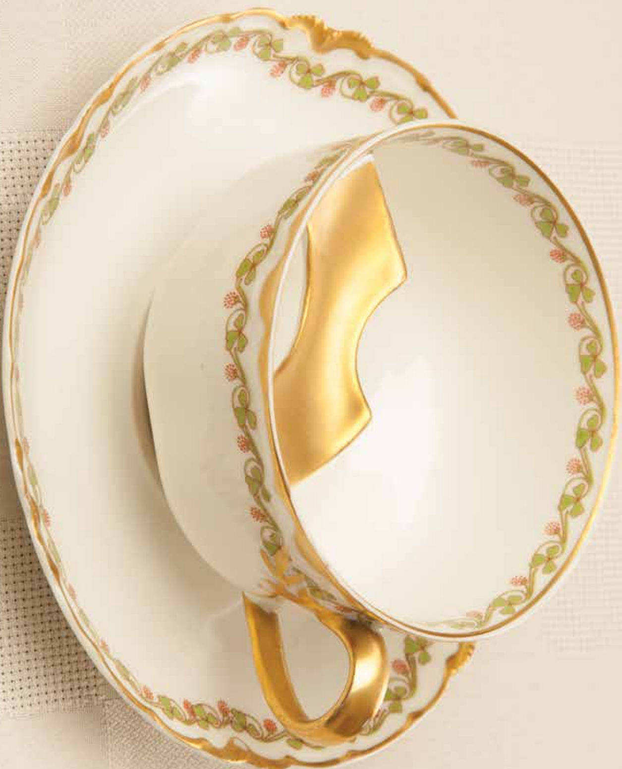
The Haviland mustache cup