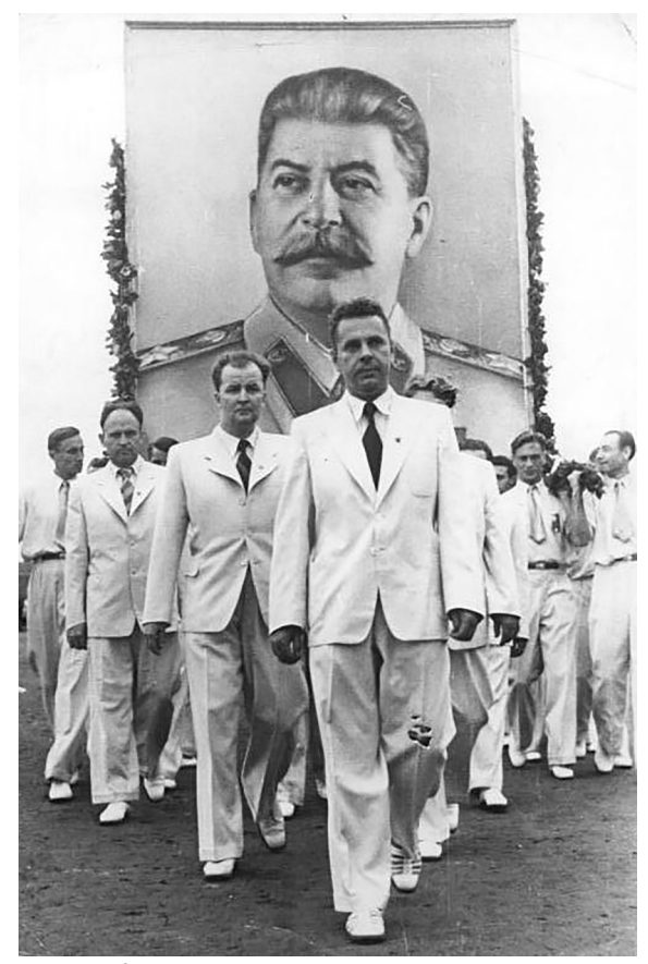
Banner of Stalin at the Komsomol's World Youth Festival in Budapest 24 August 1949

rior to the East European revolutions of 1989, and the collapse of the Soviet Union in 1991, commentators outside the region were largely reliant on printed material collected by specialist research libraries, informal arrangements with contacts 'behind the iron curtain', information that could be gleaned from visits to the region, and the testimonies and research of those who had defected to the West. Historiographies produced from within the socialist bloc were frequently shaped by the Party line. It is important not to overemphasise the level of top-down vulgarisation of the historical profession in the Soviet sphere: historians across the Eastern bloc conducted archival research and published their findings, and engaged in critical professional dialogues within their fields. In the Soviet Union, particularly after Stalin's death, and the thaw following Khrushchev's secret speech of 1956, there was genuine critical engagement about historical narratives in parts of the region. But such work was rarely translated and distributed to Anglophone audiences.