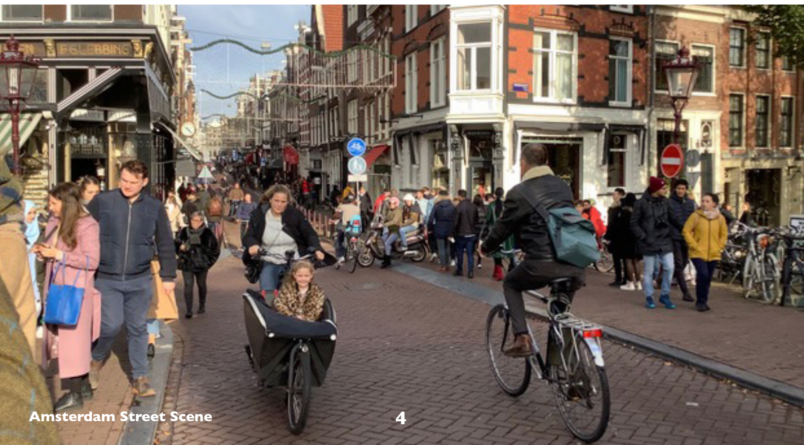
Amsterdam Street Scene