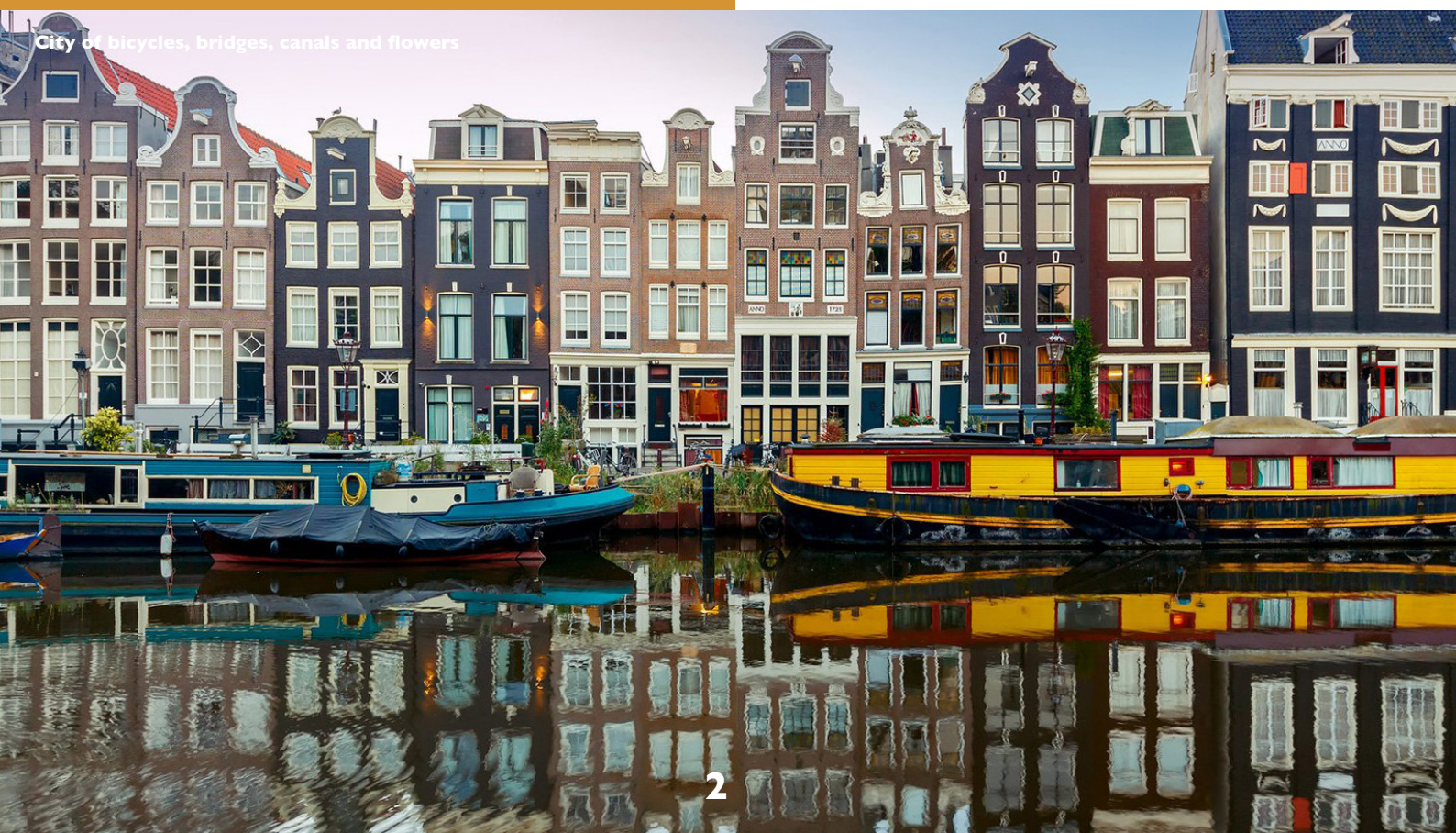
City of bicycles, bridges, canals and flowers

Dialogue & Discussion: the programme will build in time for extended discussion of presentations where possible.