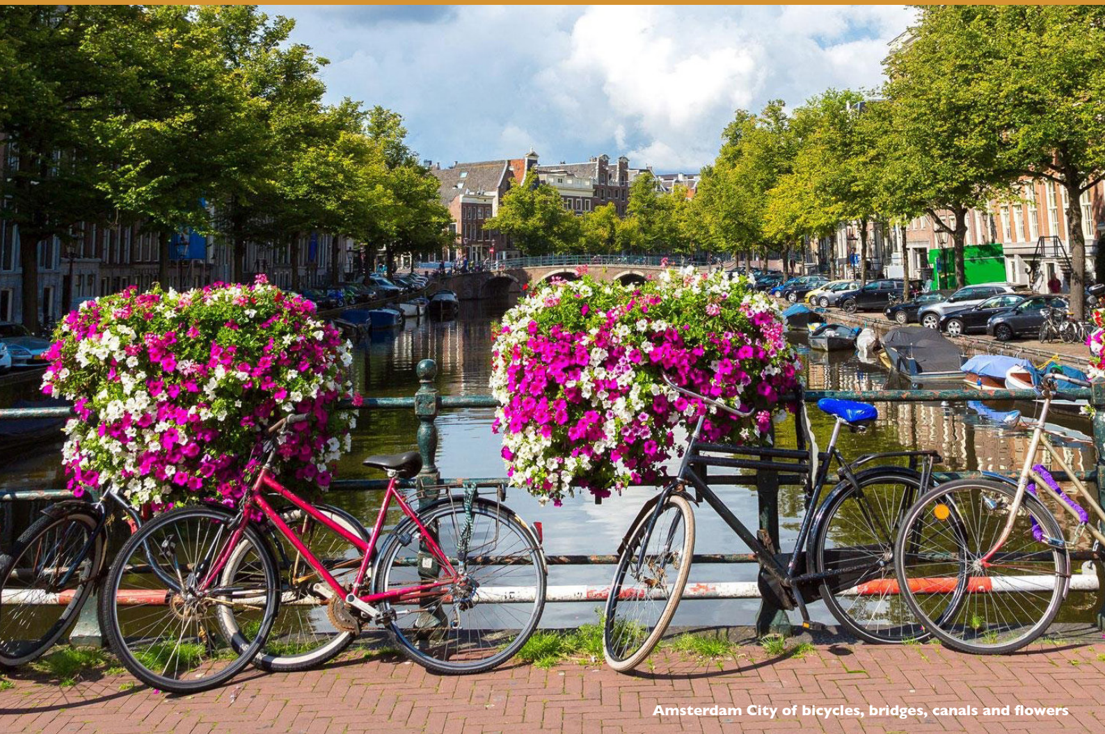
Amsterdam City of bicycles, bridges, canals and flowers

HEIRNET 2022 is meeting the Covid challenge to holding conferences through combining a live and online conference. Should Covid-19 prevent you from coming to Amsterdam, we can include your presentation, we in one of the conferences on-line sessions.