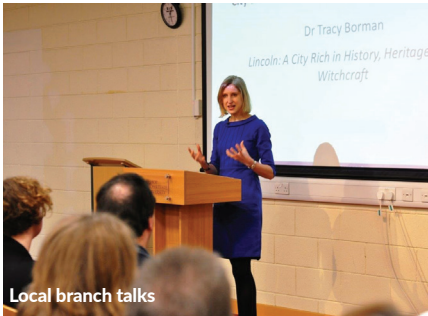
Local branch talks

The HA's 45 local branches across the UK meet regularly, offering the chance to hear from historians and researchers in person, enjoy local trips, and meet other like-minded members. You can attend events at any HA branch for free, including online talks.