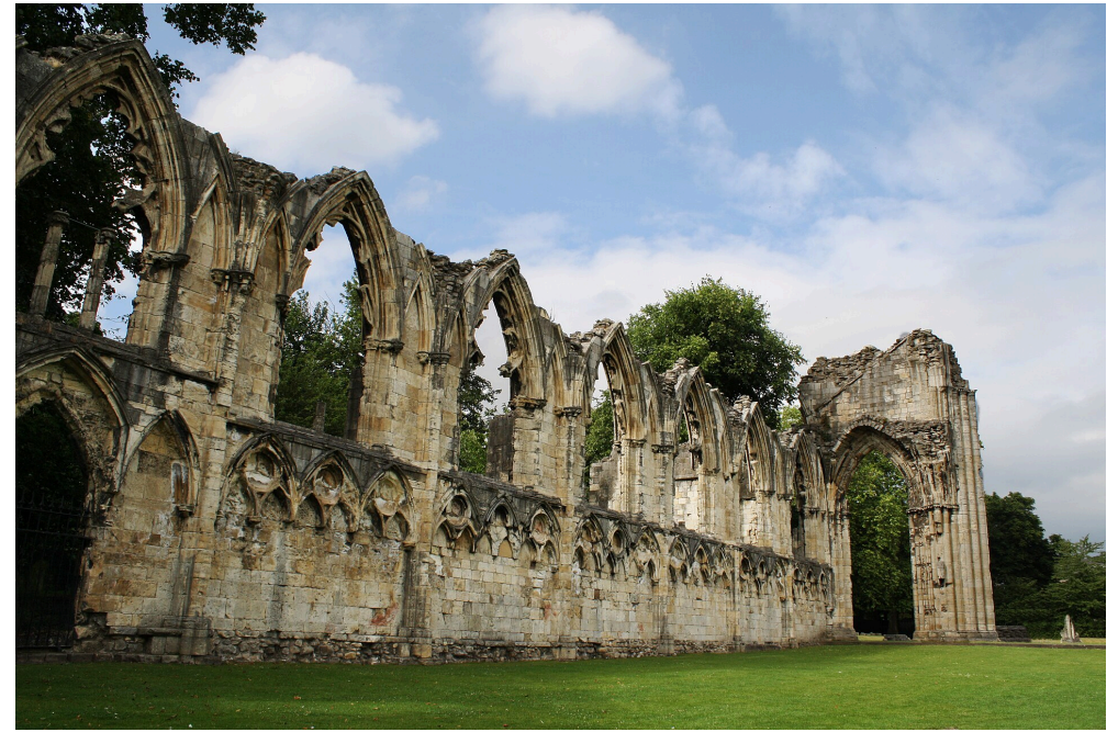
Source 1: Photographs of the ruins of St Mary's Abbey, York as it looks today