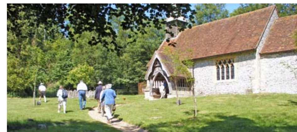
Volunteers visiting Tunworth church