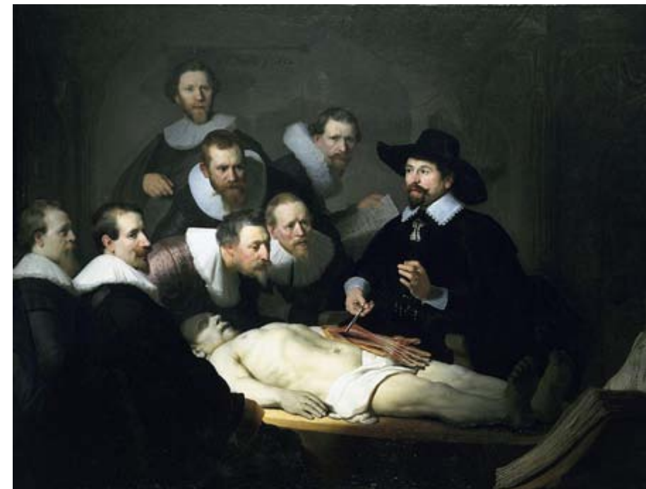
The Anatomy Lesson by Rembrandt (1632)

For more information about the conference please go to www.history.ac.uk/aac2011 .