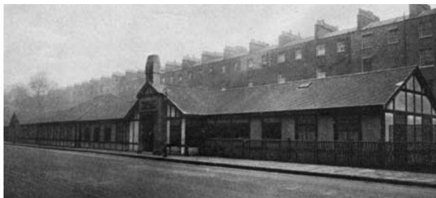
The temporary buildings on Malet Street where the IHR was initially housed until it moved into the Senate House building in 1938

To mark the Institute's birthday we are hosting a year-long celebration of other notable milestones of 1921. In that year the first PhDs in history were awarded in the UK; Marie Stopes opened her first birth control clinic; Asa Briggs, one of the UK's most distinguished historians, was born, as was the Duke of Edinburgh. Please see the IHR website for more details of these events: www.history.ac.uk .