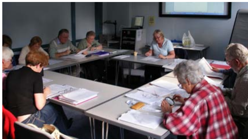
Volunteers working on transcriptions

This piece was written by the VCH Hampshire volunteers