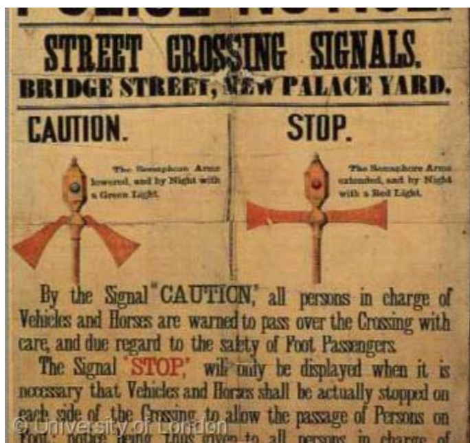
A police notice street crossing signals.