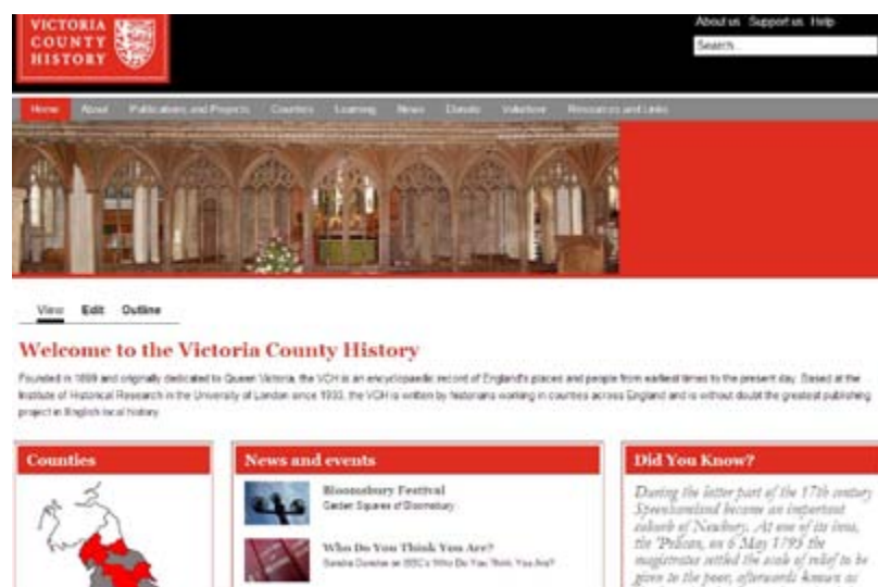
The VCH homepage.

The VCH Publications Manager will begin to contact organisations over the summer to establish reciprocal links with them. If you would like your organisation's website to share links with us then please do get in touch with a member of staff at central office or email the Publications Manager via info@victoriacountyhistory.ac.uk