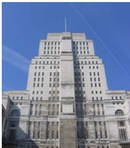
A view of the tower, Senate House, London.